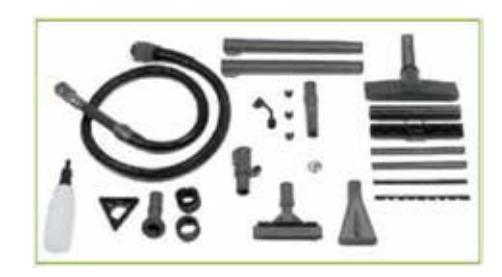
Standard Equipment STEAMY PLUS