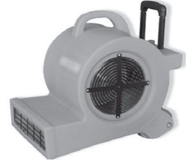
WINDY 3 SPEED