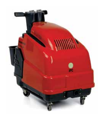
STEAMER JET M